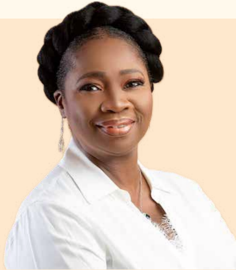
DABIRI-EREWA ABIKE Politician, Chairman NIDCOM NIGERIA

Abike Dabiri-Erewa, OON, is Chair/CEO of the Nigerians in Diaspora Commission, leading federal engagement with Nigerians worldwide. A three-term legislator, she chaired the House Committee on Diaspora Affairs and championed landmark bills including the Freedom of Information Act. Before politics, she spent 15 years at NTA anchoring Newline, shaping national storytelling. Known for diaspora protection, policy coordination and citizen advocacy, she has embedded diaspora affairs firmly within Nigeria's governance structure.