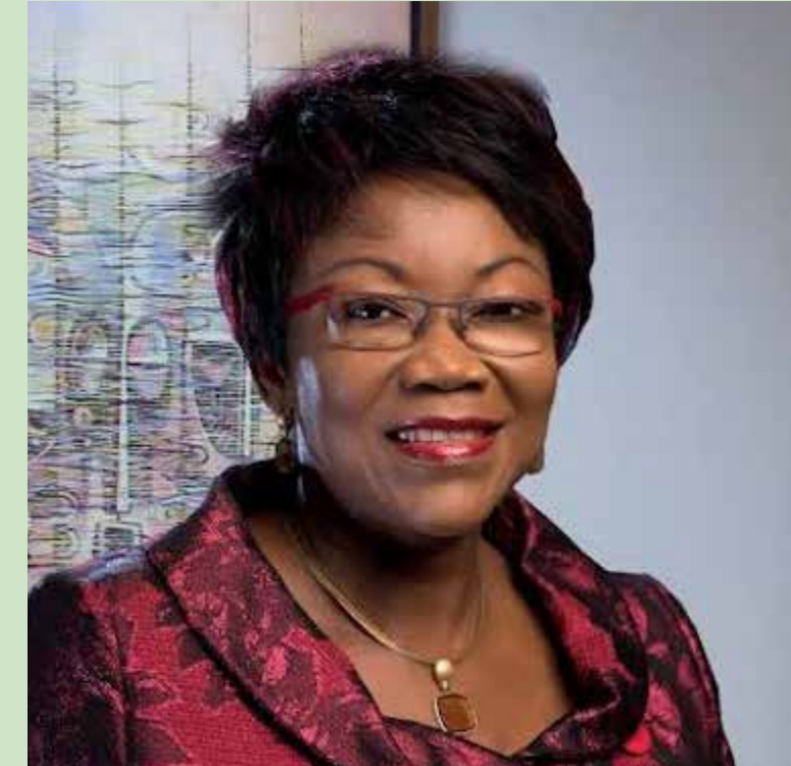
WILLIAMS DE BRUYN, SOPHIE Anti-apartheid Activist, African National Congress Women's League SOUTH AFRICA

Sophie Williams De Bruyn stands among the enduring figures of South Africa's liberation history. As an anti-apartheid activist and leader within the African National Congress Women's League, she organised resistance campaigns that challenged systemic injustice. Her courage during pivotal national protests remains part of the country's democratic memory. Williams De Bruyn's life affirms the power of principled activism in shaping a just society.