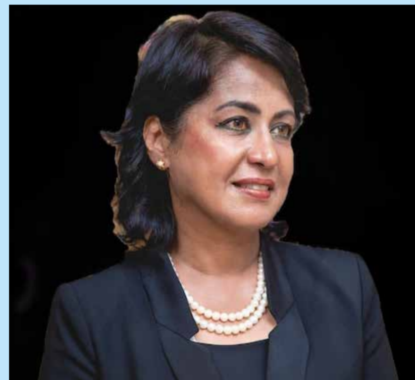
GURIB-FAKIM AMEENAH (DR.) Biodiversity Scientist, Politician, ImpactHER/ World Agriculture Forum MAURITIUS

Dr Ameenah Gurib-Fakim, biodiversity scientist and former President of Mauritius, is the first woman to lead her nation and one of Africa's most distinguished scientific voices. A PhD in organic chemistry, she has authored influential works on medicinal plants, led major research institutions and served on global advisory boards. Decorated with the L'Oréal-UNESCO Award, France's Legion of Honour and Mauritius's highest national distinction, her career bridges science, public service and sustainability diplomacy.