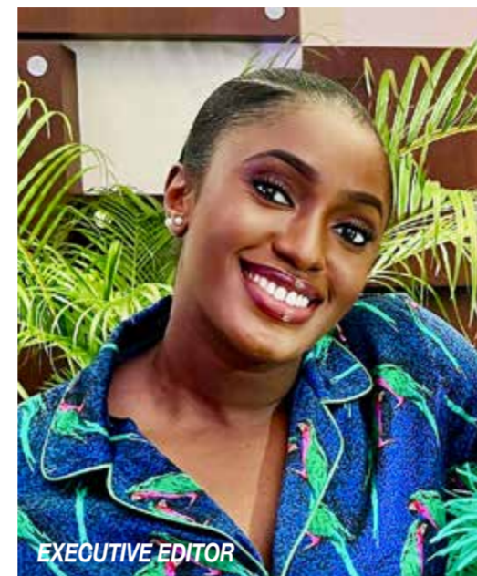
Happy International Women's Day